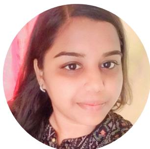
KRITHICA R IMSW SHIFT - I

It is an interesting hobby as the result are often quite diverse and creative. what is the best about the hobby is the one need not learn it from anyone ,as all it need is creativity and of course, some pots,paints and brushes too.Im interested to draw and do craft things and I'm blessed with that,I personally love the materials which I used to make any items.After having finished decorating a pot one gets a great sense of satisfaction and pleasure is far better than any gift.