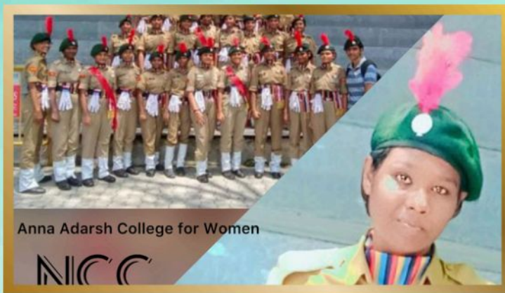
Anna Adarsh College for Women