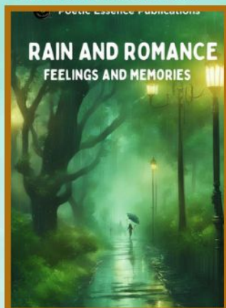
Romance (Feelings and Memories)