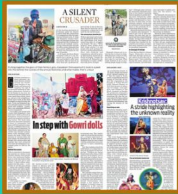
A Silent Crusader