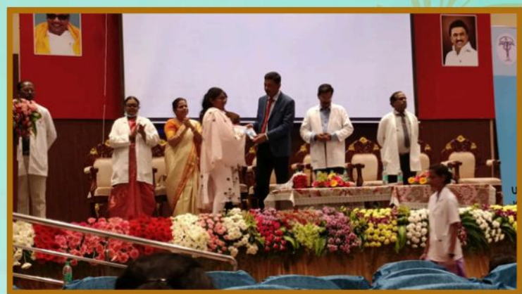
World Heart Day Poetry Writing Competition 2023