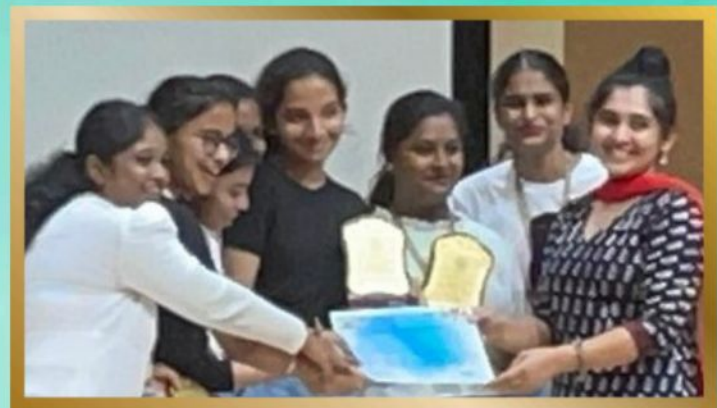
Stella Maris College