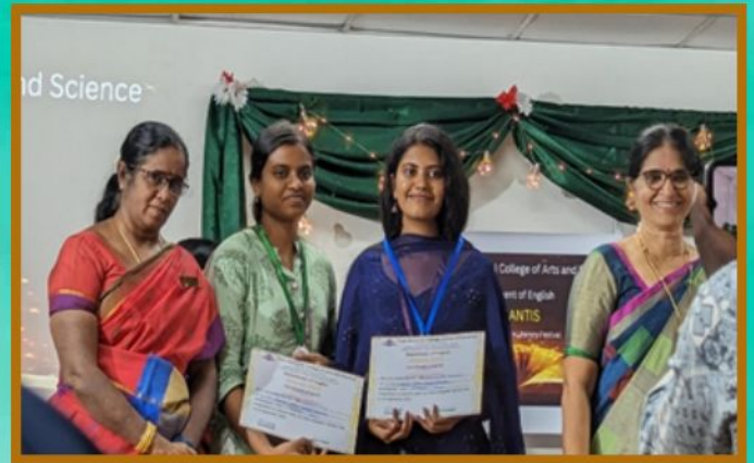
Asan Memorial College