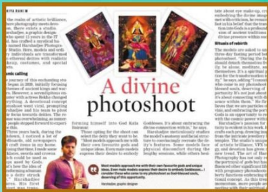
A Divine Photography