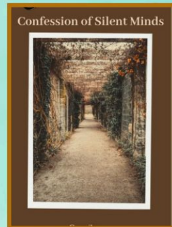
Confession of Silent Minds