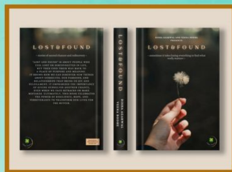
Lost and Found and Rain