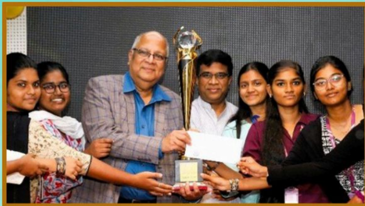
Don Bosco Arts and Science College