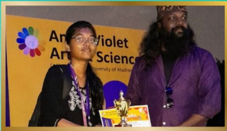
Annai Violet College of Arts and Science