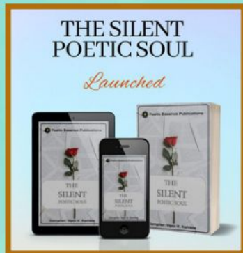
The Silent Poetic Soul

Janvidarshana. N of II MA has published content for the following anthologies of Poetic Essence Publications