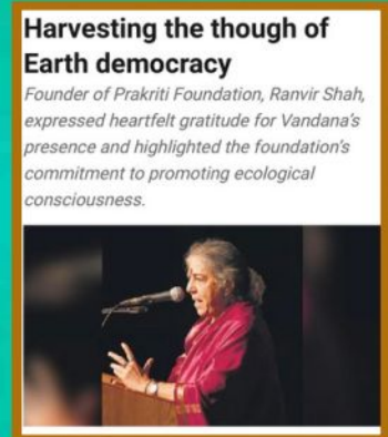
Harvesting the thought of Earth Democracy